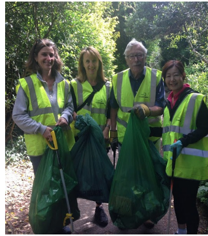
Volunteer litter pickers helping to keep our parks and public gardens tidy