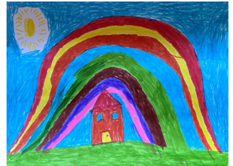
Rainbow picture by one of the local children in support of the NHS during the pandemic

“Many thanks for your help with this – I am sure that you becoming involved helped” RJ