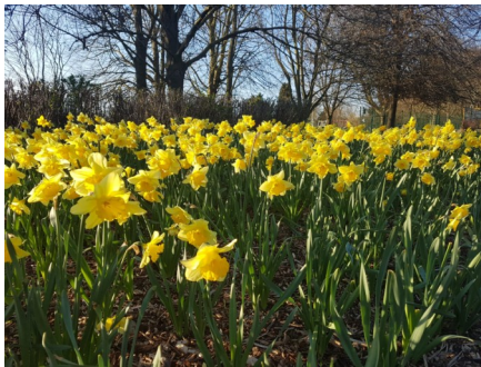
Daffodils planted in Mostyn Gardens by the Muslim Women of Merton friends group.

Know many of you personally, and we're proud of our diverse community in Merton Park Ward, where everyone gets on well together.