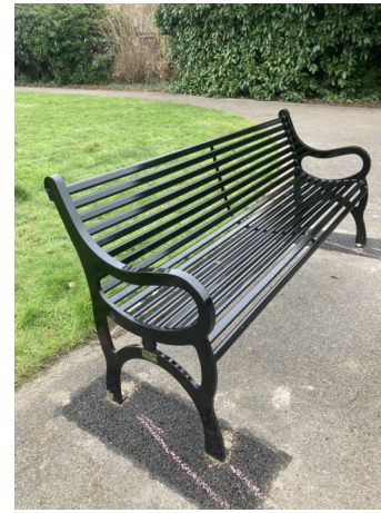
New Park Bench in Kendor Gardens paid for using the Ward Allocation Fund