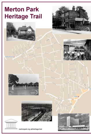
Poster for Merton Park Heritage Trail